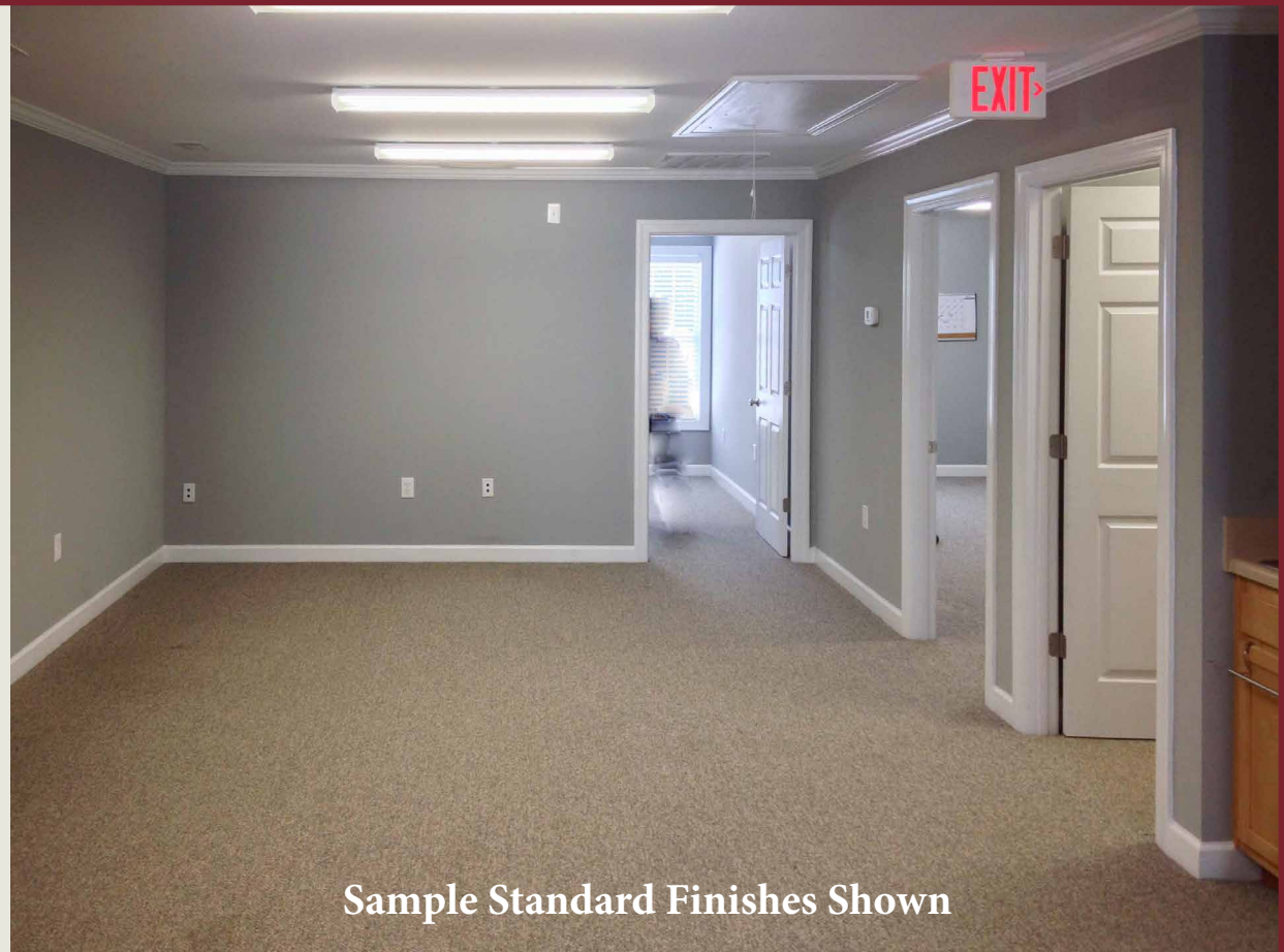
Sample Standard Finishes Shown